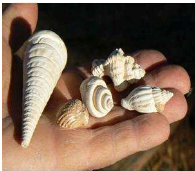
Fossils from the Nullabor

On to Mundrabilla Station where we'd been invited to stay with the owners. It was on this property of over a million acres, that a huge 10 tonne meteorite was found a few years ago. As a result of finding this one, as well as a number of smaller ones, there is now a meteorite tracking station installed on the escarpment above the homestead. (Later in our travels, we actually met up with one of the technicians responsible for the installation of the equipment – he happened to be a member of the WA Mineralogical Society. Small world!)