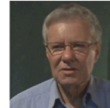
KEITH LOCKE Green MP 1999-2011